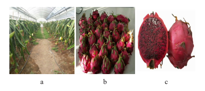
Figure 1 Pitahaya: (a) production greenhouse and (b, c) red pitahaya

Microorganisms and growth conditions. Candida albicans ATCC 10231 was cultured at 30°C for 24 h in YPD (Yeast Peptone Dextrose). Aeromonas hydrophila ATCC 19570 and Listeria monocytogenes ATCC 7644 were cultured at 37°C for 24 h in NB (Nutrient Broth) and TSB (Tryptic Soy Broth). Yersinia ruckeri and Vibrio anguillarum A4 were cultured in TSB and TSB/NaCl medium at 25°C for 24 h. Limosilactobacillus fermentum