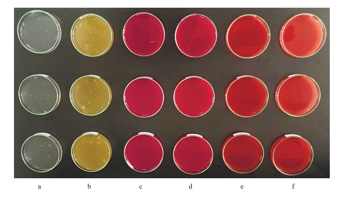
Figure 2 Preparation of edible film solutions: (a) guar gum; (b) guar gum + Limosilactobacillus fermentum MA-7; (c) guar gum + pitahaya flesh extract; (d) guar gum + pitahaya peel extract; (e) guar gum + Limosilactobacillus fermentum MA-7 + pitahaya flesh extract and (f) guar gum + Limosilactobacillus MA-7 + pitahaya peel extract

the methods of Kılınç et al. and Bambace et al. from commercially available guar gum, the pitahaya methanol extract, and the human milk-originated probiotic candidate strain L. fermentum MA-7 [27, 28]. This study included a control group and three different experimental test groups. The control group contained guar gum (1%, w/v) adjusted to the final volume with distilled water. The edible film formulation test groups included: guar gum (1%, w/v) with L. fermentum MA-7, guar gum (1%, w/v) with red pitahaya extract (10%, w/v), and guar gum (1%, w/v) with red pitahaya extract (10%, w/v) and L. fermentum MA-7. Glycerol (3%, w/v) was used as a plasticizer in all the groups. First, we determined the antimicrobial activity of the edible film solutions. Then, the solutions were dried in a Pasteur oven until they reached constant weight, to be used in characterization tests (Fig. 2).